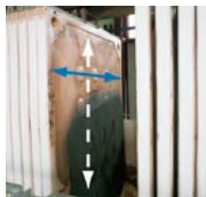
Application of SHT having high-strength warp (white) and elastic weft (blue)

The result is a filter fabric having similar retention characteristics as that of classic materials but with substantially increased durability and elasticity.