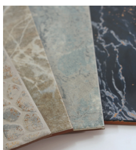
Structured and highly resistant floor tiles with SEFAR BASIC