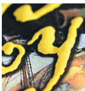
Puff ink applications on garments with SEFAR BASIC

SEFAR BASIC is designed and manufactured for t-shirts, textile and ceramic printing applications.