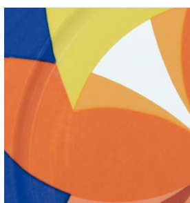
High color density on ceramics with SEFAR BASIC