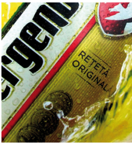
Backlit posters with halftones higher than 30 lines/cm printed with SEFAR PET 1500

SEFAR PET 1500 impresses with its performance in a wide variety of applications, ranging from graphic screen printing in small and large sizes, such as posters, displays, and signage; printing on plastics such as sporting goods, thermoformed parts, etc.; on the decoration of ceramic, directly or indirectly, and on up to textile printing and other industrial printing tasks.