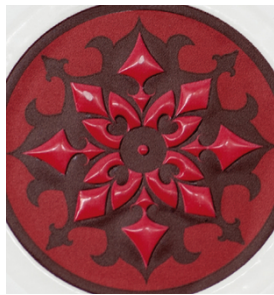
For selected clear varnish on labels, printed with SEFAR PET 1500