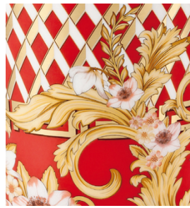
Great detail reproduction on ceramic decals (© Rosenthal) with SEFAR PET 1500