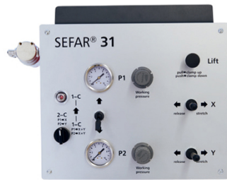
Universal, ergonomic and compact control unit in combination with SEFAR 3A