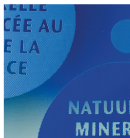
Brilliant colors and crisp print edges with UV inks. Printed with SEFAR PCF 120/305-34Y