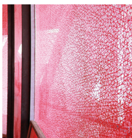
For a precise and durable print image on the glass facade with SEFAR GLASSLINE 68/175-95W