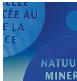
Brilliant colors and crisp print edges with UV inks. Printed with SEFAR PCF 120/305-34Y