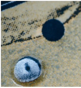
Structured and highly resistant floor tiles with SEFAR PA