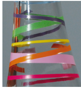
High density and sharp contours with SEFAR PA