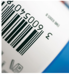
High density sharp edged bar codes printed with SEFAR PA