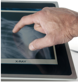
Whether edge masking or protective coatings using SEFAR PME (© Danielson Europe BV)